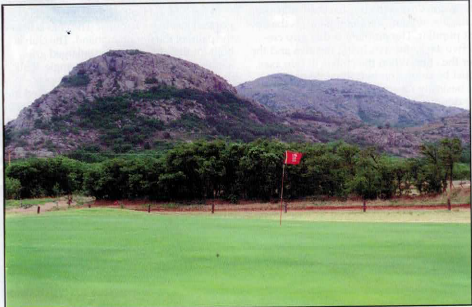
Mountains provide dramatic setting for course.

But a century ago, while the golf course would have been in Oklahoma Territory, the