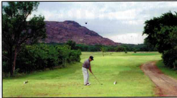
The tree-lined par-5 14th at Quartz Mountain.

Abernathy says the new facility, which has large windows for good views of the mountains, is going to let him run a full-service pro shop, with clothing, clubs, bags, hats, shoes and the works. Snacks,